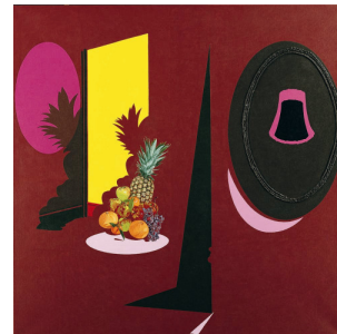
Fruit Display 1996 acrylic on canvas 76 x 76 in/ 193.4 x 193.4 cm

"I don't see how you can avoid any place suggesting a human presence"