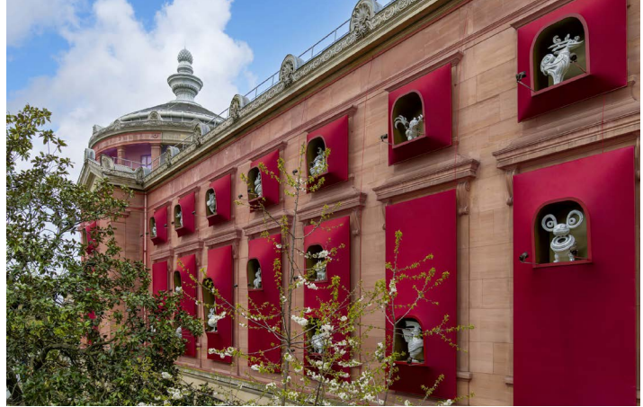
XII Calls on the facade of the Musée Guimet, Paris, June 2024.

At the centre of the exhibition is 'XII Calls', a bronze installation inspired by mythical creatures from ancient civilisations. Each figure embodies a universal value: Bravery, Wisdom, Equality, Nature, Fraternity, Exploration, Time, Inclusion, Benevolence, Authenticity, Peace and Freedom. These hybrid, syncretic beings form a contemporary bestiary addressing urgent questions about cultural preservation in a rapidly evolving world. First unveiled on the façade of the Guimet Museum in Paris in 2024, one set of 'XII Calls' has since been acquired for UNESCO's permanent collection, displayed at the organisation's Paris headquarters alongside Alberto Giacometti's 'Walking Man', testament to the enduring, universal values represented by Qiong Er's designs. The acquisition reflects Qiong Er's inclusion in other prestigious permanent collections worldwide, such as the Victoria and Albert Museum and the British Museum. As Qiong Er explains: