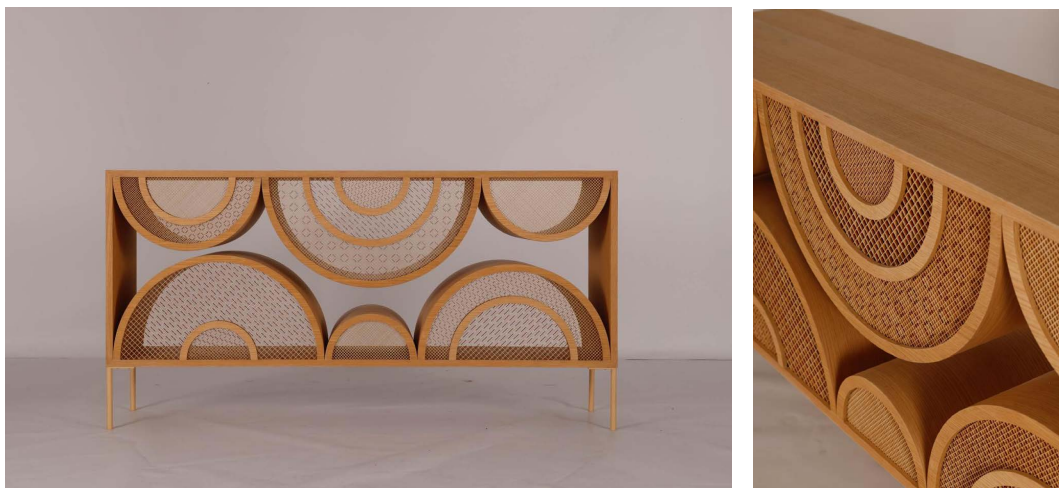
Jiang Qiong Er, Whisper Cloud , Table, 2025

In works such as 'Whisper Cloud', a display of bamboo marquetry panels, screens and tables, Qiong Er revives a craft first prized by China's literati and introduced to the imperial palace during the Qing Dynasty. This intricate process begins with the careful winter selection of mature bamboo, followed by precise cutting into thin strips and the masterful notching that transforms them into relief designs of classical elegance. These materials, transformed by centuries-old skills and contemporary imagination, are central to the spirit of 'Gardiens du Temps'.