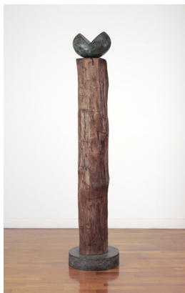
Lotus Totem, bronze and rosewood, 1962