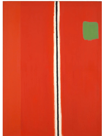
24-1958, oil on canvas, 1958

Waddington Galleries exhibits unseen paintings and sculpture that span Turnbull's pioneering career