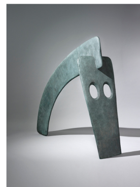
Horse, bronze, 1999