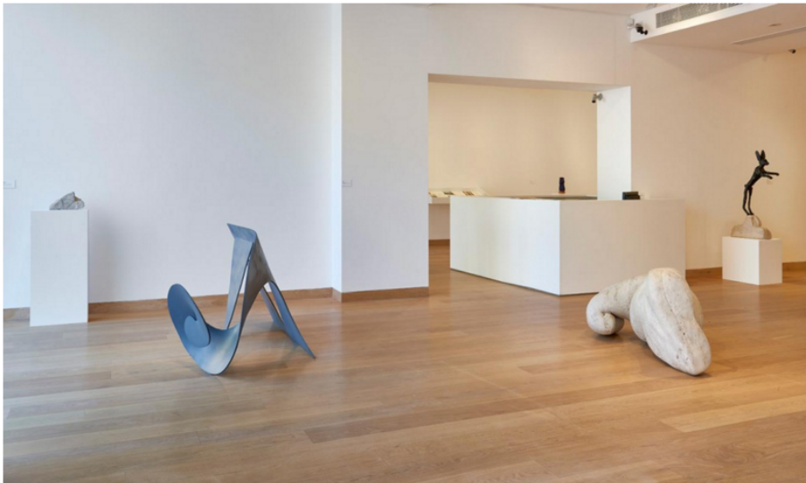
Installation view, 'Barry Flanagan, Animal, Vegetable, Mineral'.

At other points, however, you've got to wonder why Douglas bothered. The concept's ambiguities are flogged to death, and you can't help but groan at its cinematic failings. It strikes me that in making a film that sits in the grey area between mainstream cinema and video art, Douglas wants to have his cake and eat it. While it's fun-ish as a thriller and raises intellectually stimulating possibilities, I'm not certain you can justify its failings as an entertainment by pleading artistic nuance.