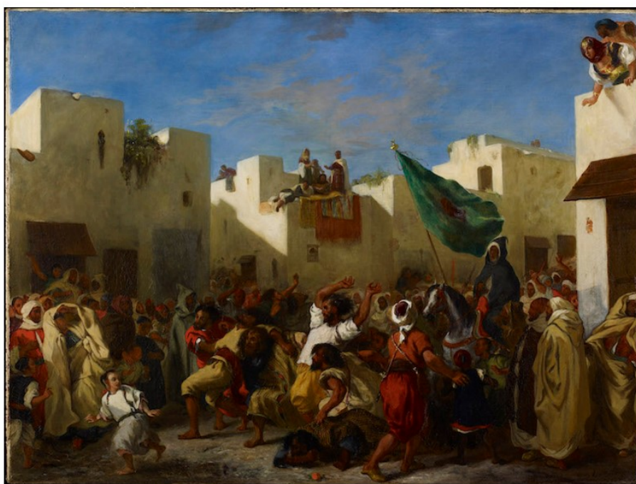
Convulsionists of Tangier (1837-38), Eugène Delacroix