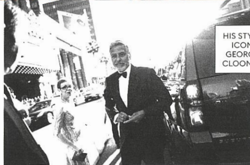
HIS STYLE ICON GEORGE CLOONEY