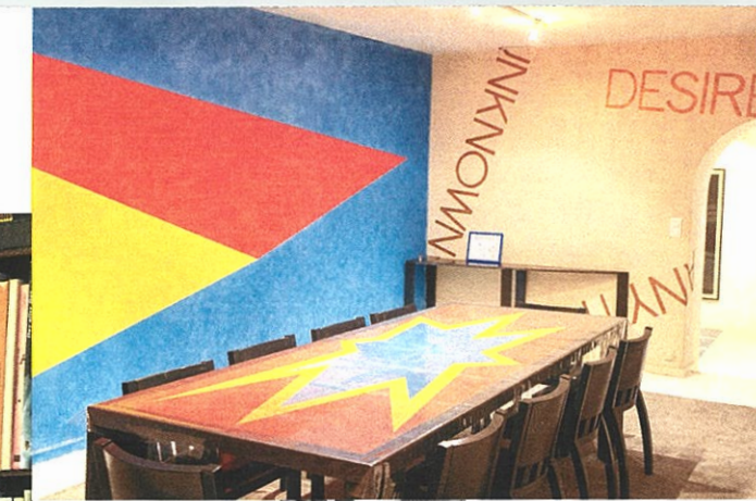
Above: Asymmetrical Pyramid Drawing #428 , 1985, and table, 1991, both by Sol LeWitt, and Untitled Wall Painting for Bernar , 2004, by Robert Barry in the mill's dining room. Below: a drawing by Sol LeWitt on the night table in Venet's bedroom