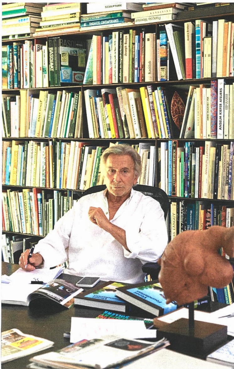
Above: Venet at his office table in the Usine. Right: Intersection , 2012, by Anish Kapoor in front of Venet's Points , 2013, and (at rear) Elliptic Elliptic , 1999, by James Turrell. Below: Point , 1984, by Venet