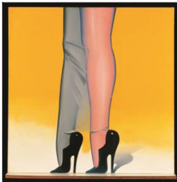
Allen Jones , First Step , 1966 Allen Jones Collection