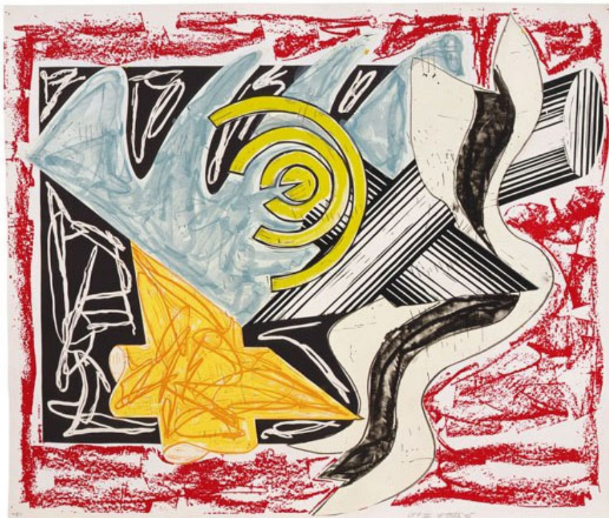
Illustrations after El Lissitzky's Had Gadya: 2. A hungry cat ate up the goat , Frank Stella, 1985; 42½" x 53"; hand-colored and collaged with combinations of lithographic, linoleum-block, silk-screen, and rubber-relief printing (unique).

Text by Natalia Rachlin | November 14, 2014