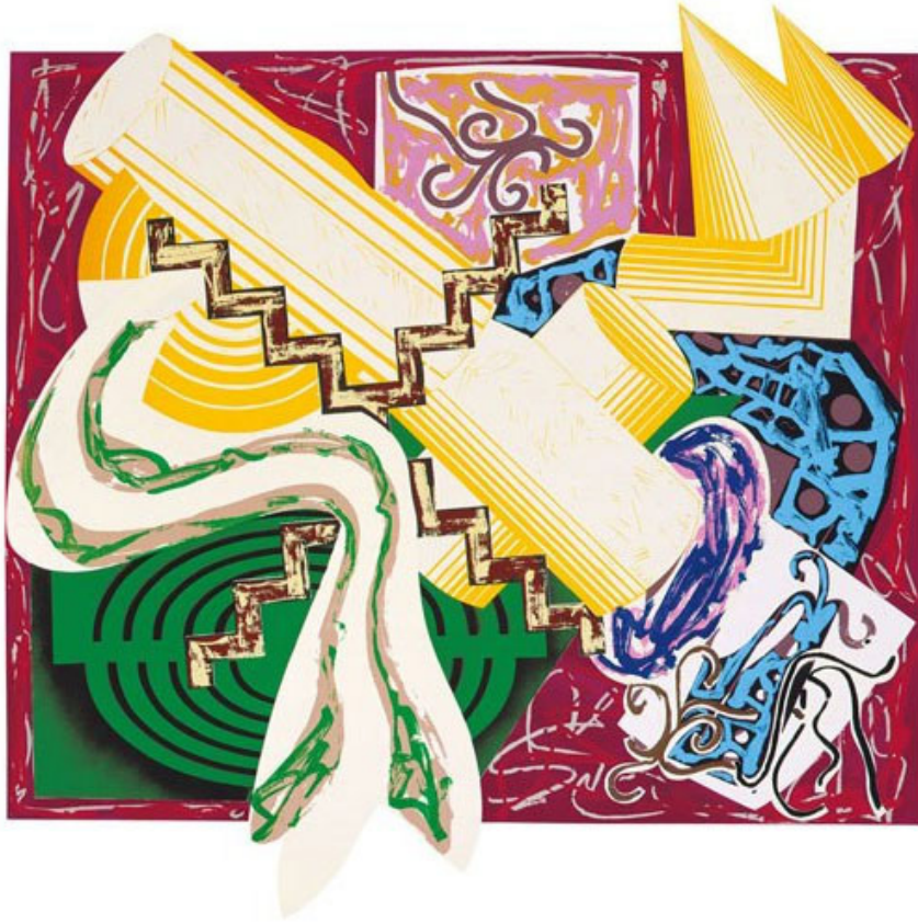
Illustrations after El Lissitzky's Had Gadya: 4. Then came a stick and beat the dog, Frank Stella, 1985; 52¾" x 52¾"; hand-colored and collaged with varying combinations of lithographic, linoleum-block, silk-screen, and rubber-relief printing (unique).

The series was inspired by a visit to the Tel Aviv Museum in 1981, where Stella came across an exhibition of the Russian avant-garde artist El Lissitzky, who in 1919 created a series of gouaches that visually interpreted the Jewish Passover song "Had Gadya (The Only Kid)."